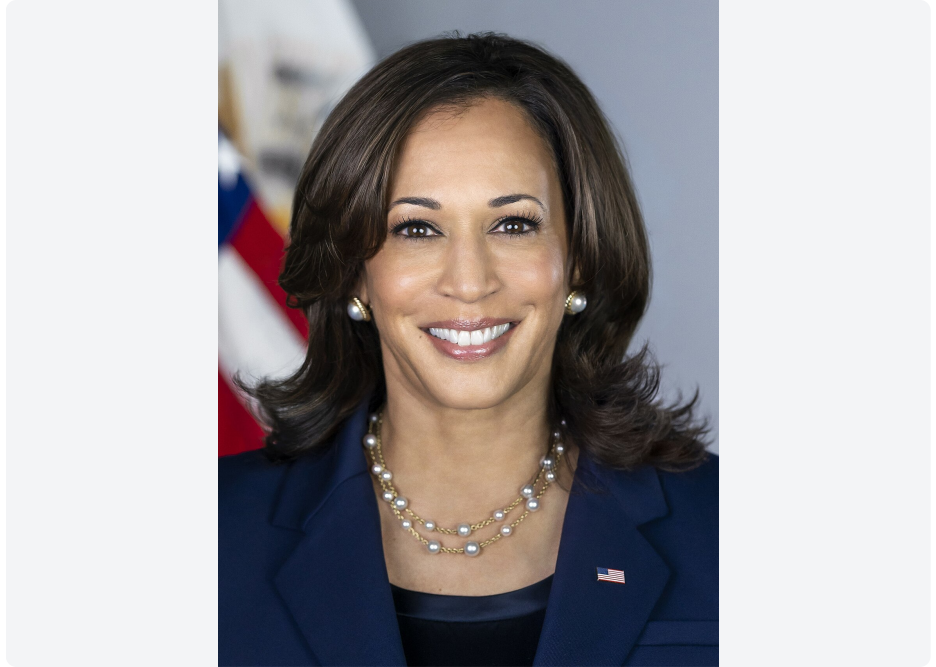
Kamala Harris at a rally in 2024

Throughout her campaign, Harris emphasized her expertise in law and policy, gained from her tenure as California's Attorney General and U.S. Senator. She addressed the need for national abortion protections, gun control, and federal cannabis legalization. Harris's economic platform, described as populist, included capping prescription drug costs and expanding the child tax credit.