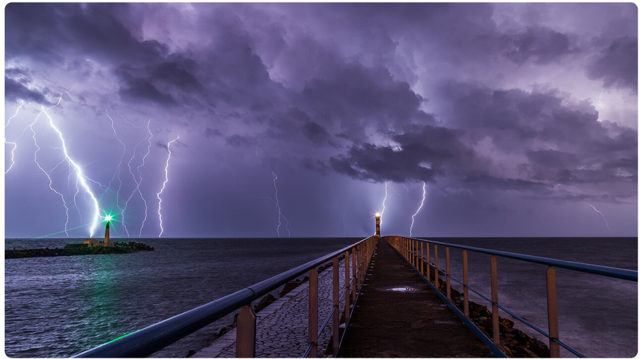
Thunderstorm near Port-la-Nouvelle, France

From gentle breezes to violent storms, weather phenomena are a testament to nature's complexity. These events are often triggered by temperature contrasts between the equator and the poles, facilitated by large-scale atmospheric circulations like the Hadley and Ferrel cells. Weather systems, including cyclones and thunderstorms, emerge from instabilities within these flows. As Earth's axis tilts, seasonal variations occur, further influencing weather patterns.