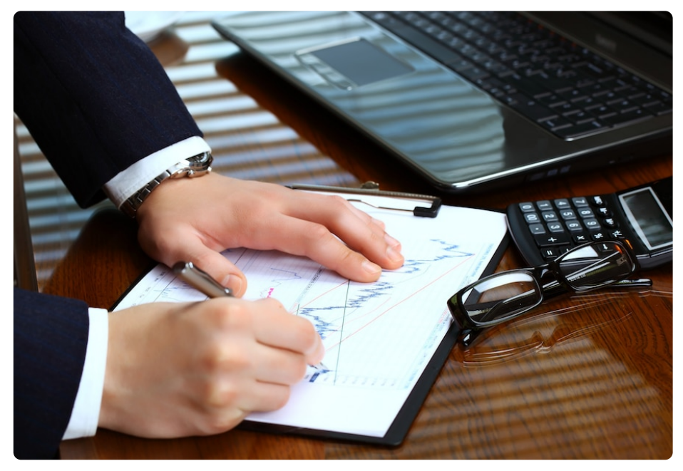
Businessman at Work

Stock markets experience a steady climb, driven by investor confidence and speculation. Banks extend generous credit, encouraging investments. This period of economic expansion creates an atmosphere of optimism and progress. Entrepreneurs launch new ventures, capitalizing on the buoyant mood. The middle class grows, and small businesses flourish, bolstered by the era's economic dynamism.